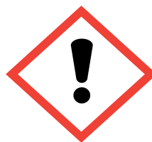
GHS07 - Eye irritation, class 2

Hazard statements H: H 272 - May intensify fire; oxidizer H 319 - Causes serious eye irritation