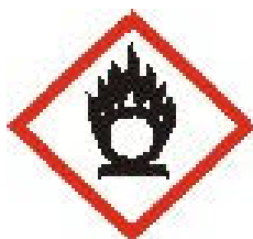
GHS03 - Oxidizer solid, class 3